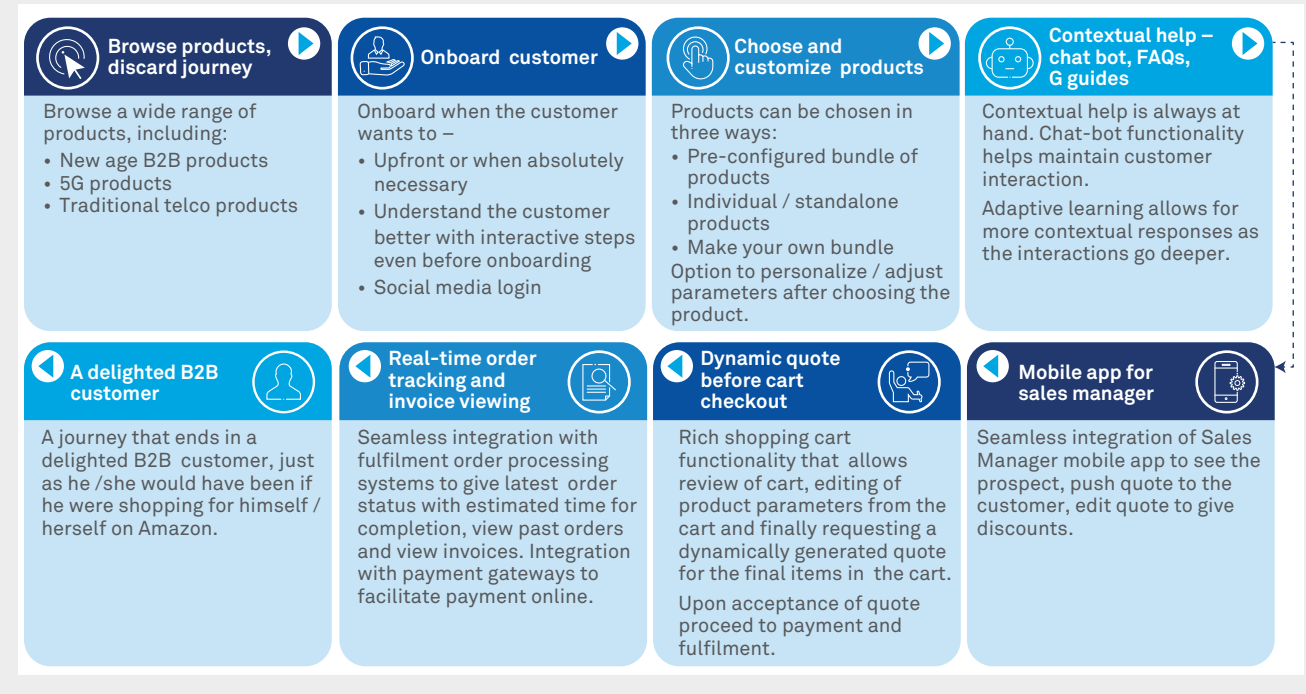
Figure 2: An example of a B2B user journey

The platform adapts to the different B2X user journeys based on business requirements and delivers a seamless experience across the value chain. The marketplace approach allows enterprises to have a unique tailor-made approach for their business scenario that is also flexible and adjustable.